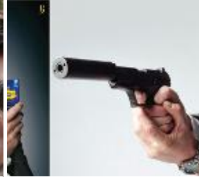
Where are the Bonds today?