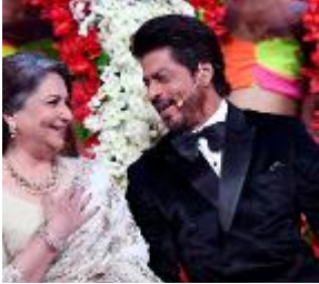
Bollywood shines on the red c...