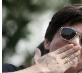
Shah Rukh Khan's rare photos ...